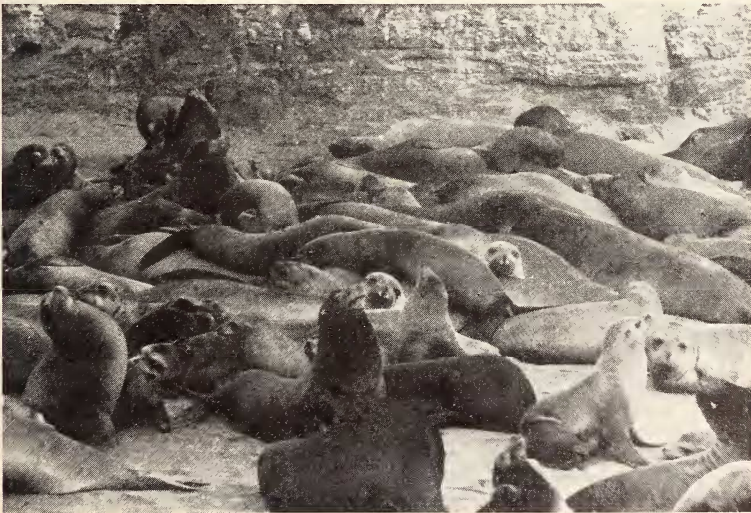
Fig. 5. California sea lion bulls and immatures in the foreground next to a group of immature elephant seals. Año Nuevo Island, California, November 13, 1963

The elephant seals, since they frequent the sandy beaches and are present in varying